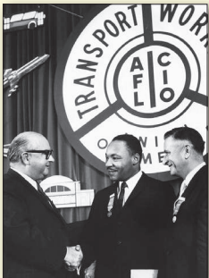
Mike Quill greets Dr. King before the civil rights leader addressed the TWU convention in 1961.

1980: Wins uniform changes at Southwest Airlines so female flight attendants no longer have to wear suggestive clothing that brought on sexual harassment during flights.